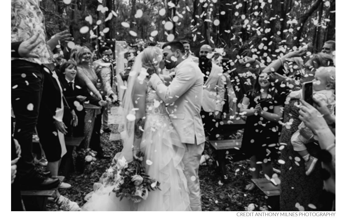
The beauty of saying your vows beneath the trees, surrounded by your loved ones - an unforgettable moment.